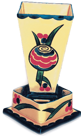
BEACH PARTY | Most patterns don't have documented names, so Druse calls this one "beach ball."